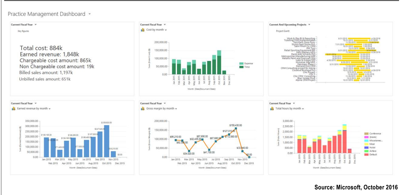
Figure 2: Microsoft Dynamics 365 for Project Service Automation (PSA) Dashboard